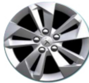
16 inch 'Taranaki' alloy wheels