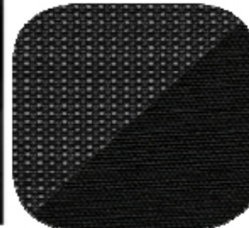
Curitiba Grey (OAFY)